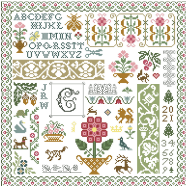
Example of one of the samplers.