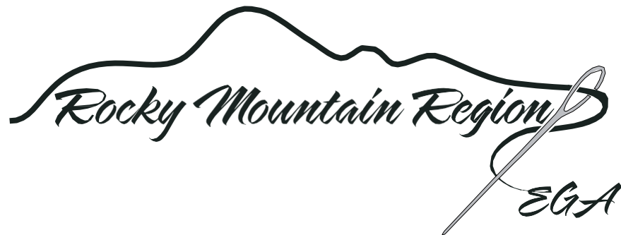
Rocky Mountain Region Logo